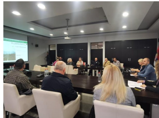
PUBLIC PRESENTATION OF THE DRAFT SPATIAL PLAN FOR THE SPECIAL PURPOSE AREA