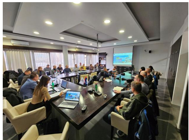
PUBLIC CONSULTATIONS IN THE AFFECTED MUNICIPALITIES (INĐIJA, SREMSKA MITROVICA)