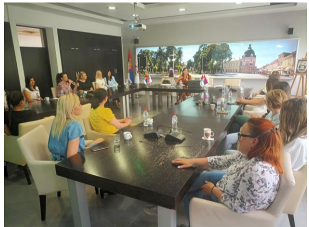
FOCUS GROUPS WITH WOMEN IN INĐIJA AND SREMSKA MITROVICA