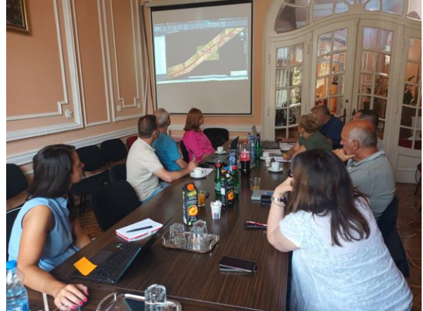
MEETINGS IN AFFECTED MUNICIPALITIES (ŠID, RUMA)