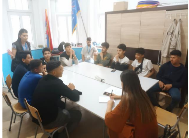
EXPERT MEETING AND FOCUS GROUP CONCERNING THE PROJECT IMPACT ON MIGRANTS