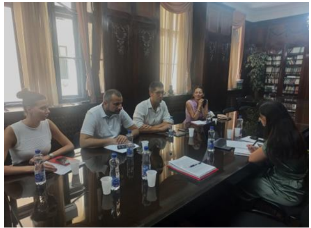
MEETINGS WITH THE RAILWAY SECTOR AND COORDINATION MEETING BETWEEN SRI AND EXPERT TEAM MEMBERS